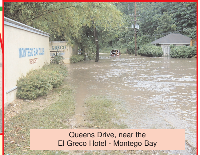
Queens Drive, near the El Greco Hotel - Montego Bay