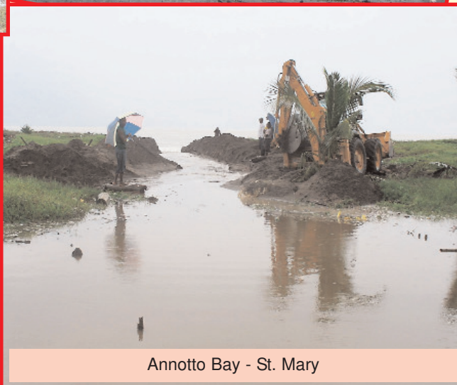
Annotto Bay - St. Mary