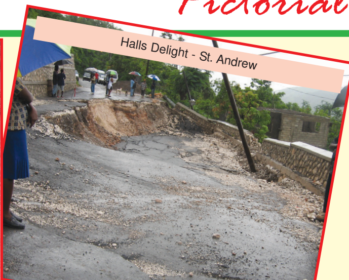
Halls Delight - St. Andrew