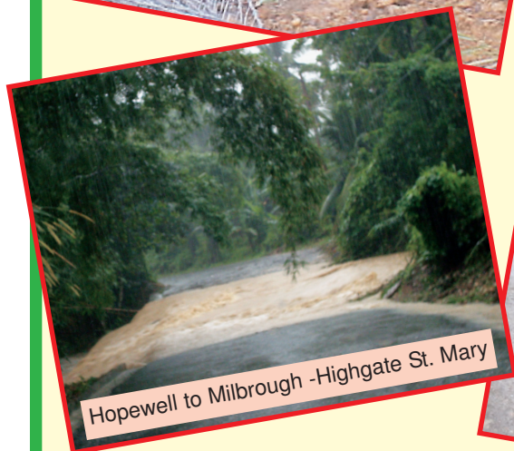
Hopewell to Milbrough -Highgate St. Mary