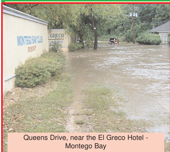
Queens Drive, near the El Greco Hotel - Montego Bay