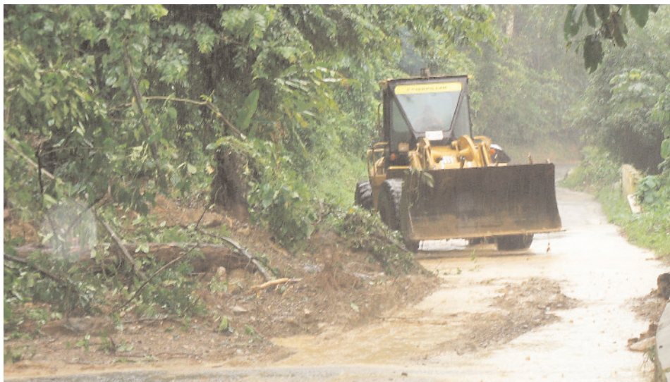
Georgia - St. Mary, during the clearing of a landslide.

The patching programme is now being augmented with a 69 million dollar special flood damage programme. This programme will seek to carry-out drain cleaning activities on major corridors around the island. Some beautification work will also be done, as embankments will be bushed, curb walls painted and lanes marked. Work under this programme is now underway and is expected to be completed in early January.