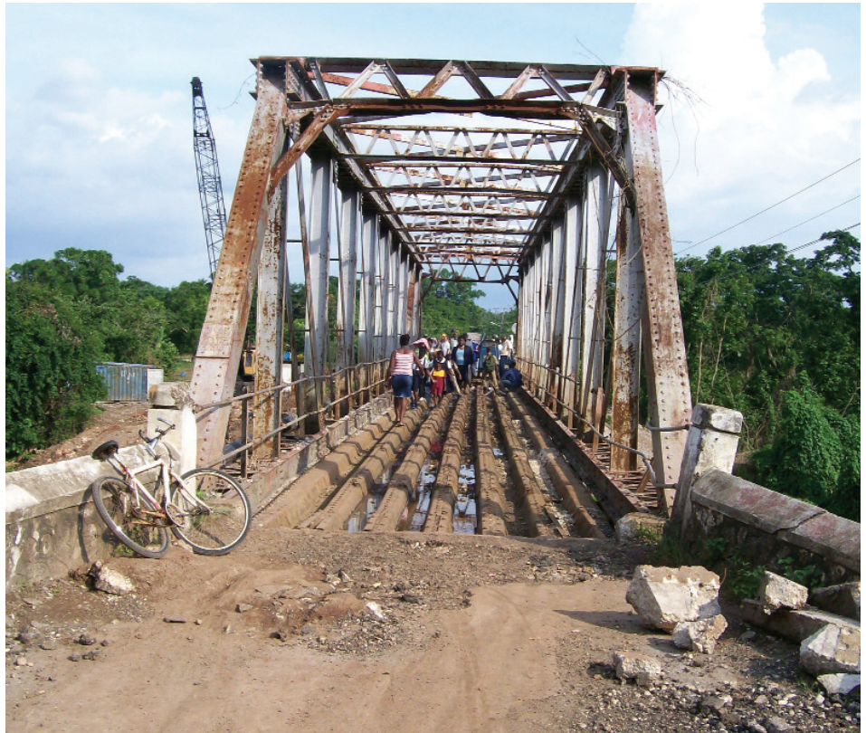
Milk River Bridge - to be replaced under the R.A. Murray Programme