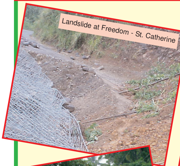
Landslide at Freedom - St. Catherine