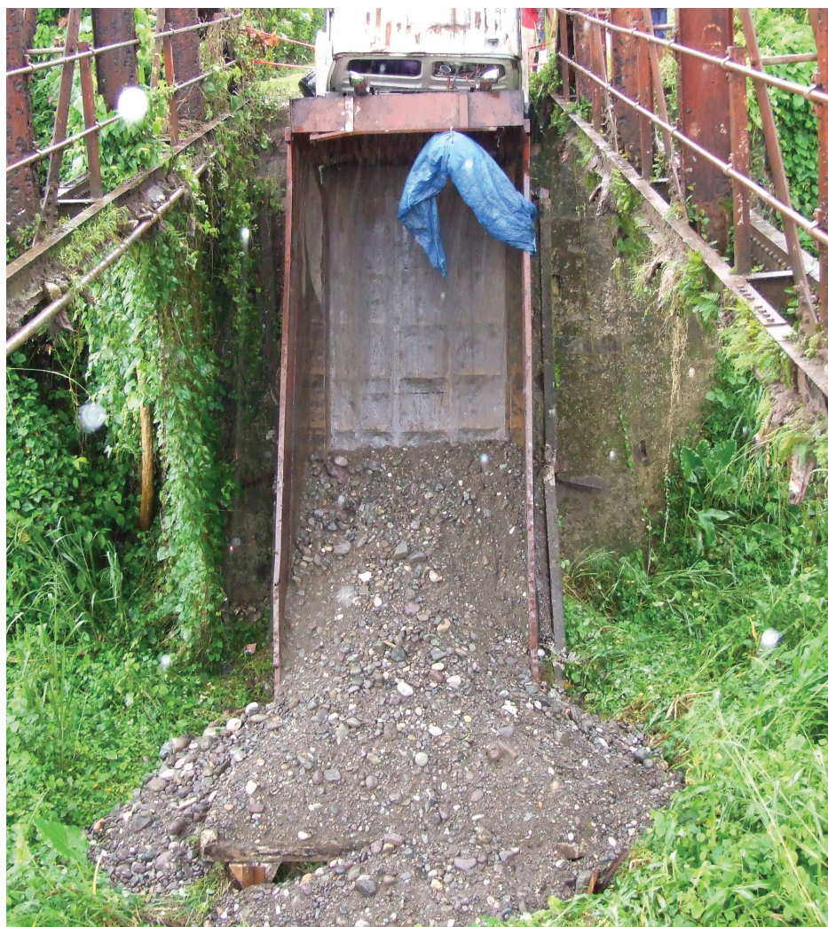
The effect of an overweight truck on a bridge. The Dry River Bridge in the Rio Grande, Valley Portland, collapsed on October 16, under the weight of this overloaded truck. The truck which was laden with aggregate weighed more than 12 tonnes, the limit put on the structure.