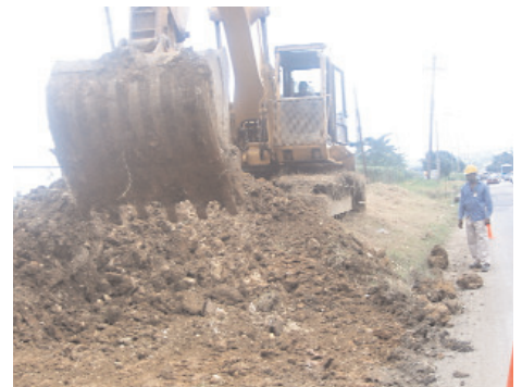
Bogue Road – (St. James) Construction work to widen the carriageway

At the end of this project motorists and residents of the area should see a reduction in the instance of flooding.