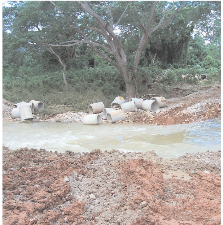
The washed out Milk River Ford.

The Parish of St. Elizabeth was a bit more fortunate than Clarendon in terms of damage done to the road infrastructure.