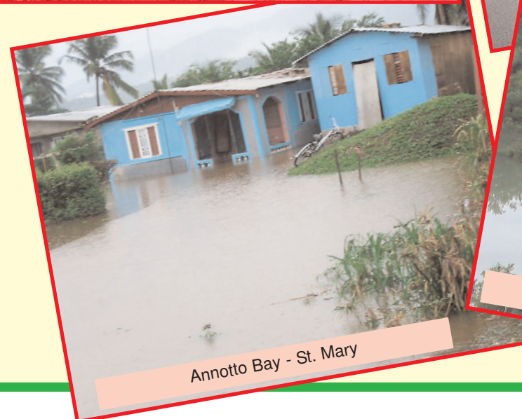
Annotto Bay - St. Mary