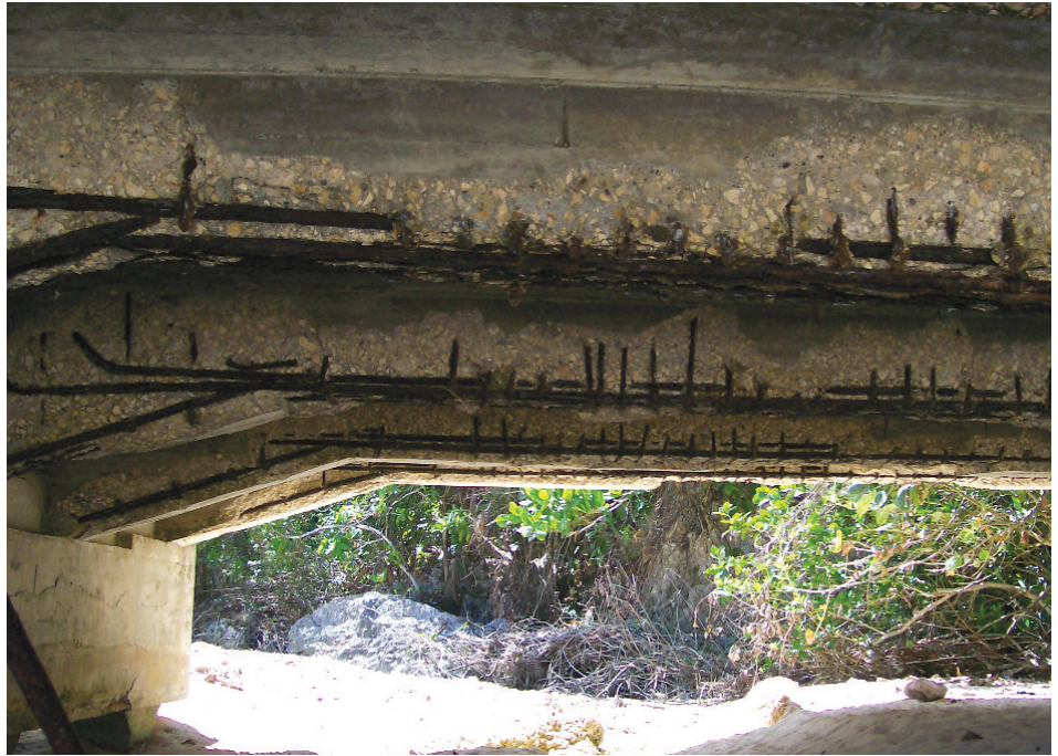
Black River Bridge, Portland. - to be replaced under the R.A. Murray Programme

In the meantime, residents of communities such as Bog Walk and Linstead should have a new structure on which to travel by the third quarter of the new year, when the new structure should be completed. The residents have been traversing the roadway for many years with the aid of a Bailey Bridge. The original bridge was closed by the NWA following an inspection that revealed serious defects that would put people at risk. The R.A. Murray Programme will also result in the replacement of bridges at Queens River, Hanover; Martha Brae and Troy in Trelawny and Seven Rivers in St. James. New structures are also expected to be built at Johnson River in St. Thomas, Waterloo Road in St. Andrew and Angels River in Clarendon. River Training work is also expected to be done within the channels of several of the rivers, where structures are going to be built.