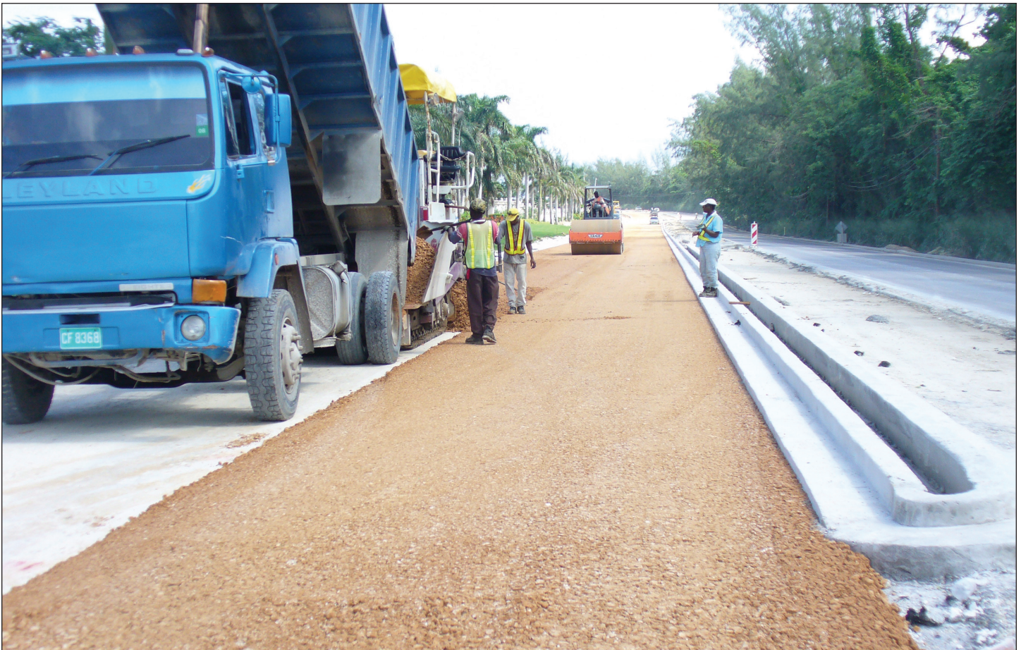
Base course being laid in the vicinity of the Iberostar Hotel (Segment 2A of the North Coast Highway)

Motorists traveling along the road from Falmouth, Trelawny to Montego Bay, St. James will have more reasons to be happy by the end of December. The newly constructed dualised roadway between Seacastle and the Sangster Airport Round-a-bout should be in use by then. The 27-kilometer stretch forms Segment 2A of the Northern Coastal Highway Improvement Project. Thirteen of the 27 km is being dualised. Work on the project is progressing steadily despite several setbacks, the most recent being the torrential rains the island experienced during the month of October.