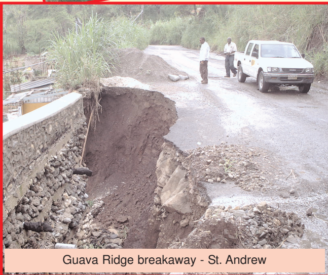
Guava Ridge breakaway - St. Andrew