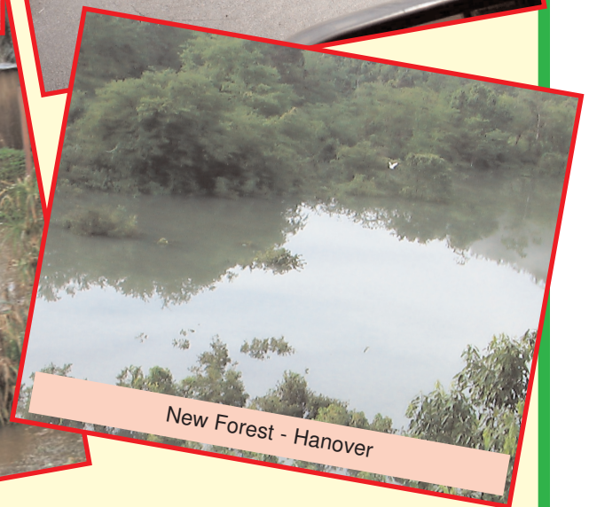
New Forest - Hanover