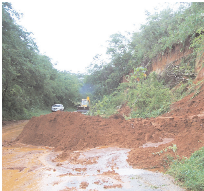
A blocked Maggoty roadway.

Nonetheless the damage done in this area is undeniable. Areas such as Big Yard, Goshen, Dry River, Holland Bamboo Avenue, Whites Corner and Middle Quarters were flooded repeatedly during the month. Detours had to be created at Middle Quarters (Luana to Tombstone) and Goshen (Tombstone to Gutters) where the road surface was inundated for days.