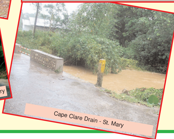
Cape Clare Drain - St. Mary