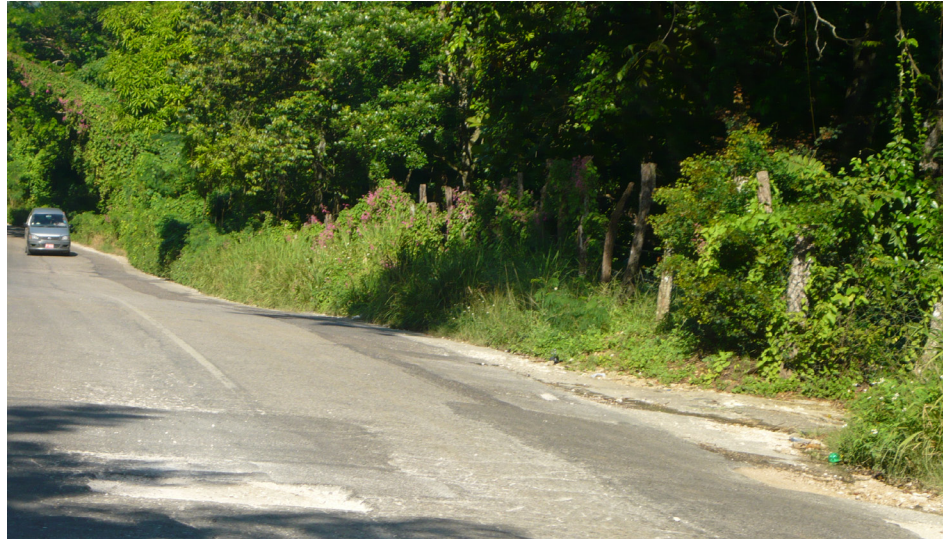
A section of the Scotts Cove to Luana main road, St. Elizabeth

The programme has been introduced in an attempt to arrest the deteriorating conditions along many of these corridors despite government's budgetary constraints.