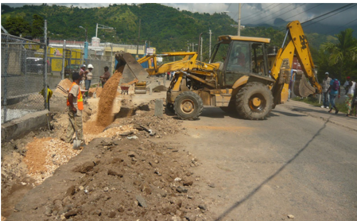
Construction of 550 metres of sidewalk in progress along Gordon Town Road, St. Andrew

This phase of the improvement project complements Phase One, when traffic signals were installed at the intersection of Old Hope Road, Golding Avenue, Papine Circle and Chandos Place. Just under Nine Million dollars were spent to complete the first phase of the project.