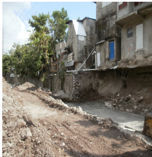
Breakaway at Red Hills Road, St Andrew

What we are today is result of our own past actions; Whatever we wish to be in future depends on our present actions; Decide how you have to act now.