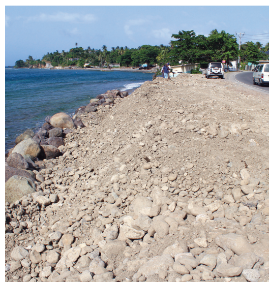
Orange Bay, Portland - Sea Defence