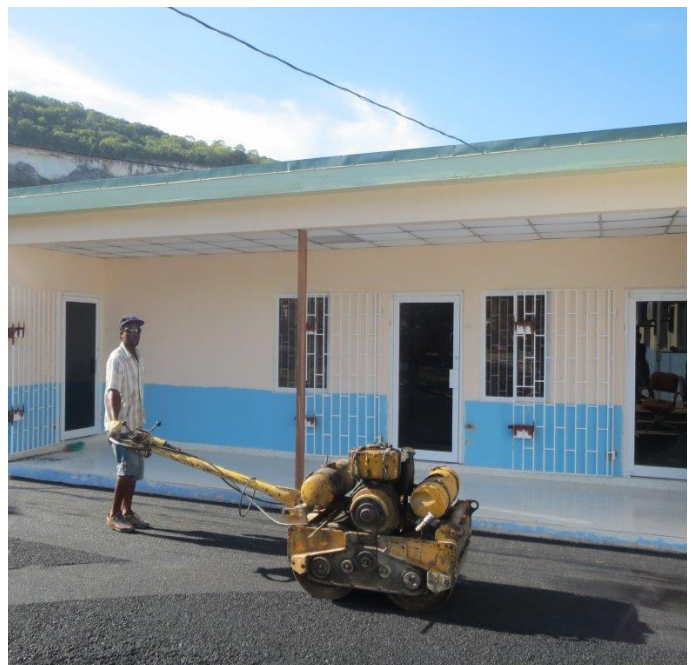
A view of the newly renovated office space which now houses the St. James Parish Office in Flankers, St. James.