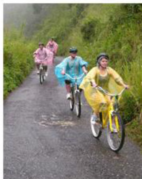
Tourists travel, in varying weather conditions, along the Wakefield to Hardwar Gap roadway while participating in the Blue Mountain Bicycle Tour