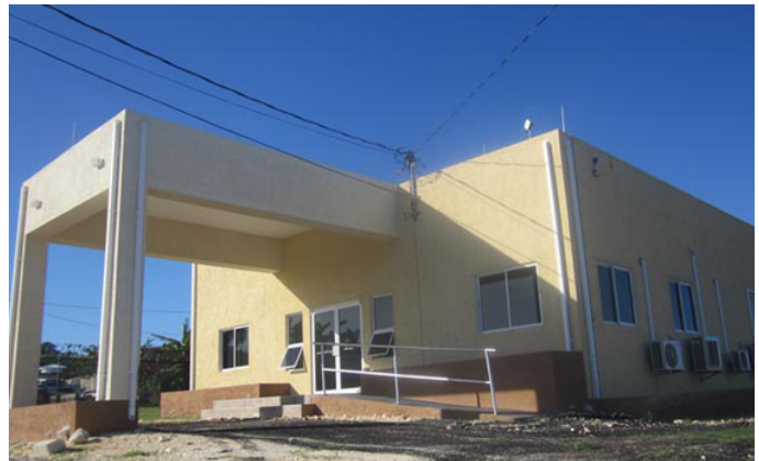
A view of the newly constructed Parish Office in Haughton Court, Hanover.

The current location has been deemed unsafe for staffers due to pest infestation as well as a general deterioration of the structure which now serves as the Parish Office. As such the NWA, in December 2013, commenced the rehabilitation of a building located on the grounds of the West Regional Office, also in Flanker. This project which is valued at approximately $3 million is now in an advanced stage of completion.