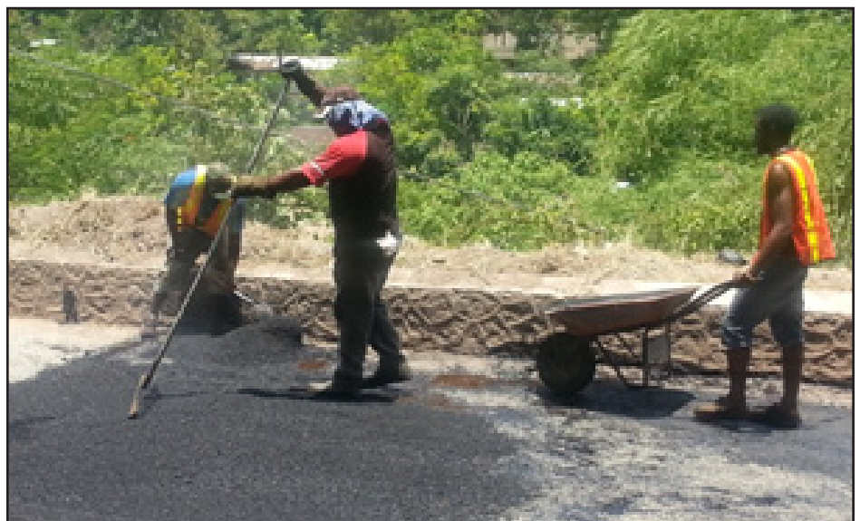
NWA Patching crew at work on the Gordon Town Road, St. Andrew