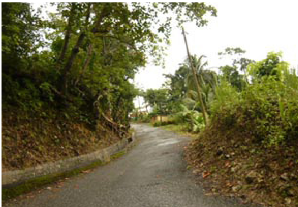
Before and after photos of the bushing along the Hope Bay to Chips Hall road section in Portland

Motorists and pedestrians alike have commented on the works. As usual, there are varying degrees of satisfaction but the general consensus is that the roadways appear much safer now that there are fewer bushes. The programme, therefore, can be deemed a success as we 'fly' into the Holy season of Christmas with greater visibility and safety on our roads.