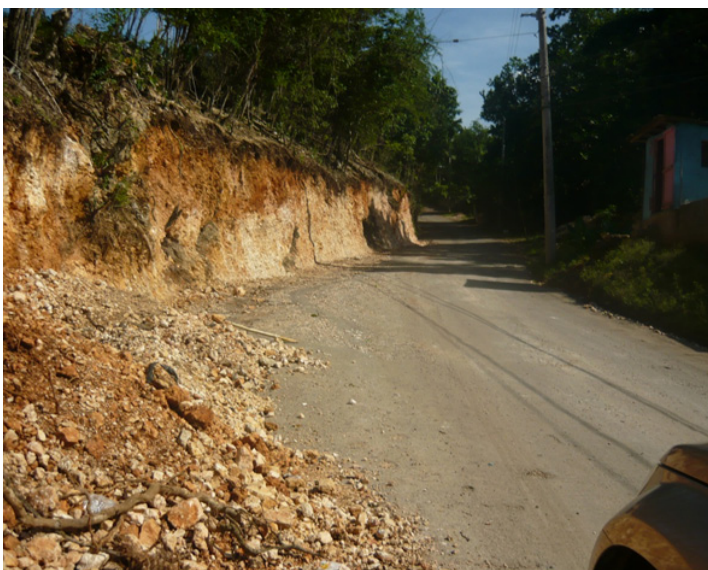
A section of the Sligoville main road that is being widened