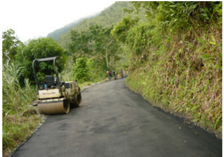
Sheet patching being done along the Wakefield to Hardwar Gap control section as part of the Blue Mountain Bicycle Track Project