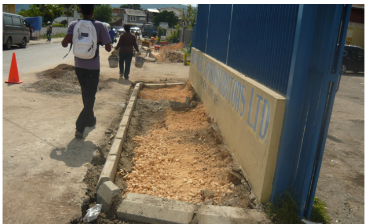
Sidewalk construction in progress along Gordon Town Road, St. Andrew