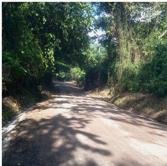
Cleaning of side drains along the Colonel Ridge to Kupius main road

Also in the north, the eight (8)-kilometre stretch from Kelits (Shooter) to Macknie to Douglas Castle benefitted under the programme. Some 4,500 square meters of the road were targeted for attention. The scope of works included cleaning of side drains,