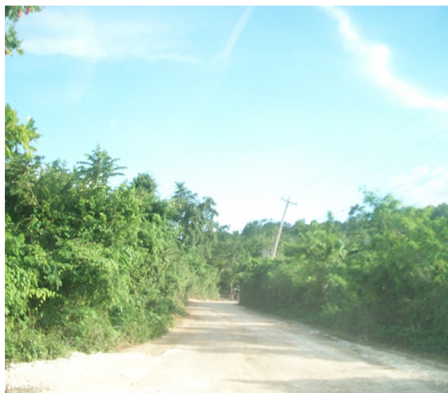
Preparatory work along Cocoa Piece to Alexandria

temporary restoration of scoured areas and patching, using Asphaltic Concrete. The works were completed in December 2013 at a cost of $12 million.