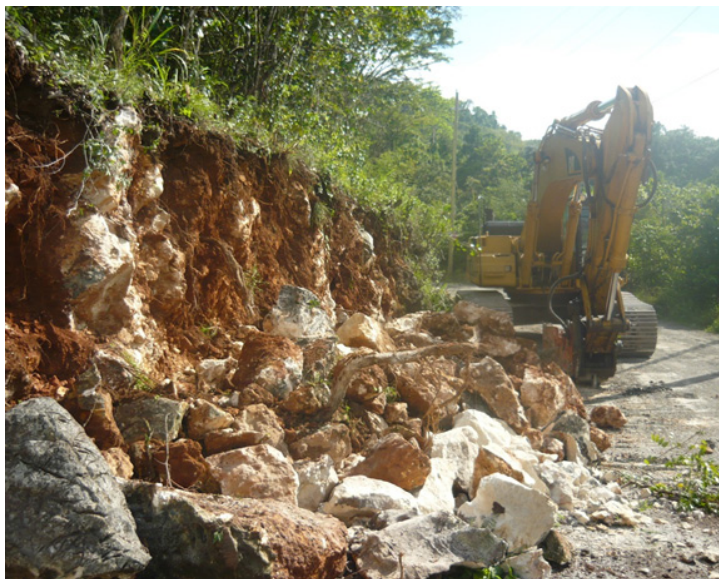
Rock Excavation along the Sligoville main road, St. Catherine