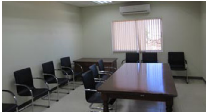
Conference Room – Hanover Parish Office