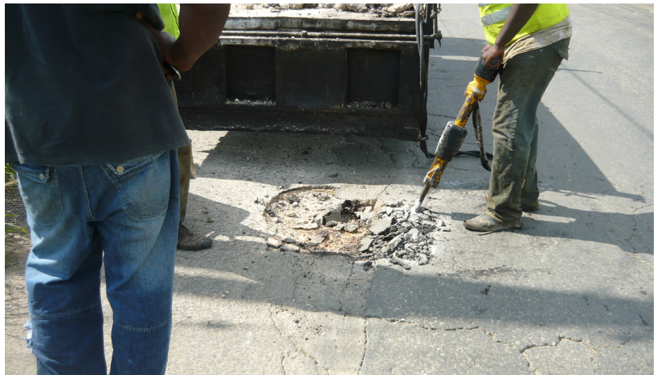
Squaring of potholes along the Gutters to Tombstone road, St. Elizabeth