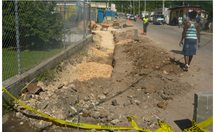
A section Gordon Town Road, St. Andrew – being prepared for the construction of 550 metres of sidewalk