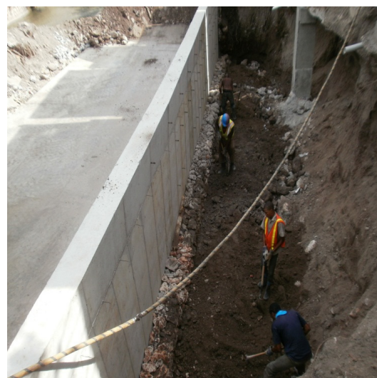
Construction of Retaining Wall at Red Hills Road, St Andrew