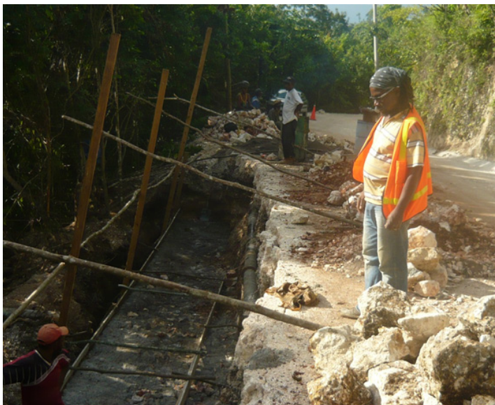
Construction of a retaining wall along the Sligoville main road