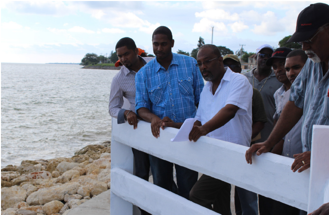
Minister Buchanan being joined by Member of Parliament for South-East St. Elizabeth, Hugh Buchanan as they look at the recently completed project to reconstruct the Black River Sea Wall.