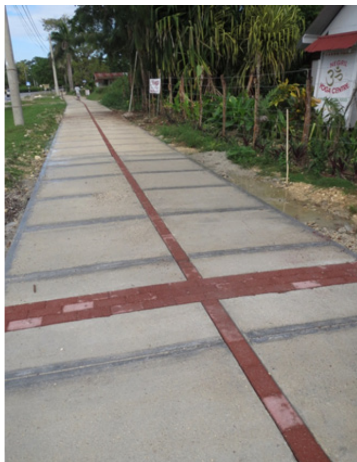
A view of a section of the Shared User Path constructed along a section of the Norman Manley Boulevard in Negril, Westmoreland.