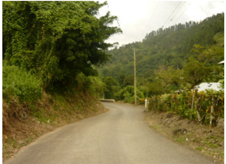
A section of the roadway which was cleared of bush

The road surface had also suffered some disrepair and has been remedied through the partnership of of the NWA and the TEF who teamed up to restore the corridor. Under the project, which began on November 4, 2013, and lasted for four weeks, the Wakefield to Hardwar Gap roadway was cleared of bush and overhang and repaired with hotmix patching. The project which cost $4,991,552.13 was funded by the TEF and done by NWA's Force Account team.