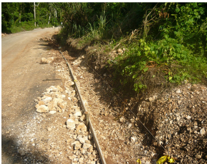
A section of the Sligoville main road being prepared for the construction of a 'V' drain

Outstanding works include construction of 'V' drains, paving with Asphaltic Concrete, road markings and signage. The contract was awarded to Build Rite Construction Company Limited for an amount of $324 million.