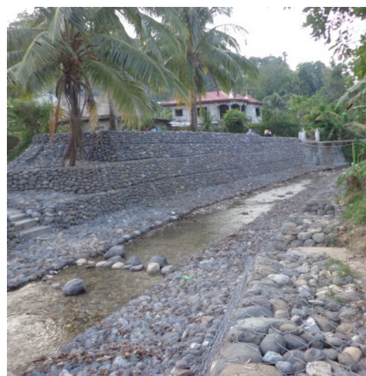
River Training at Mount Oakley (Caneside River), Portland