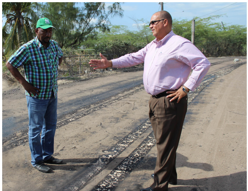
Minister Azan and MP for South East Clarendon, Rudyard Spencer discussing the development of the road works