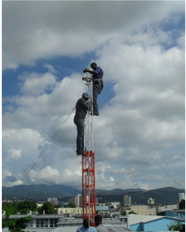
Wireless Broadband Communication Tower erected the NWA, Head Office, St Andrew.

Wireless broadband radio links are now being finalised to facilitate communication between the TMC in Kingston and locations in Montego Bay, St James; Ocho Rios, St Ann; and Falmouth, Trelawny. These works should be completed by April 2014.