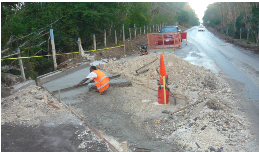
Construction work in progress