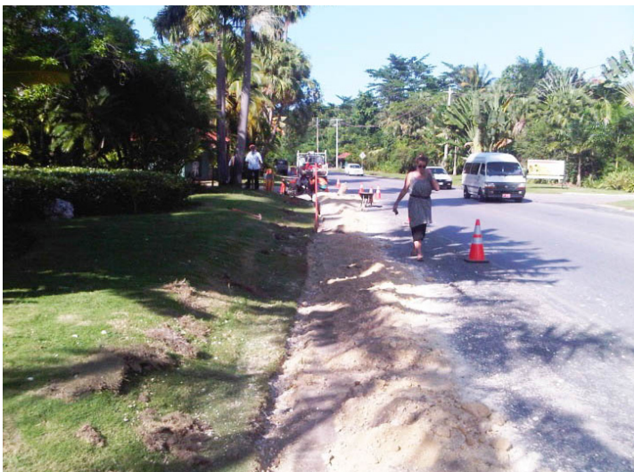
Negril, Westmoreland, Jamaica (tourist destination): Trench being cut for the installation of Fibre Optic Cable.