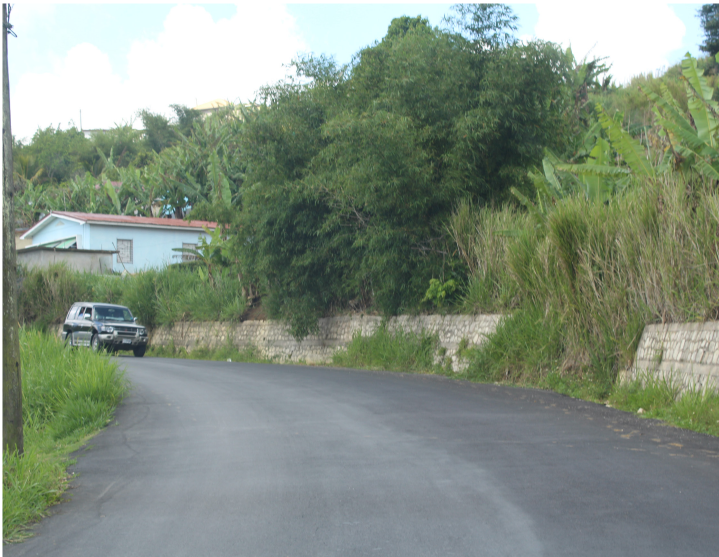
A rehabilitated section of the Highgate Hall to Dump main road

An eight million dollar partnership between the Road Maintenance Fund (RMF) and the NWA has resulted in a smoother ride for persons wishing to travel from Manchester to Trelawny, along the Dump to Highgate Hall main road. The corridor, sections of which have been in a serious state of disrepair for years, recently got some much needed attention. The project requires an additional $10-million to complete the effort, but already that which has been completed is a welcomed change for motorists.