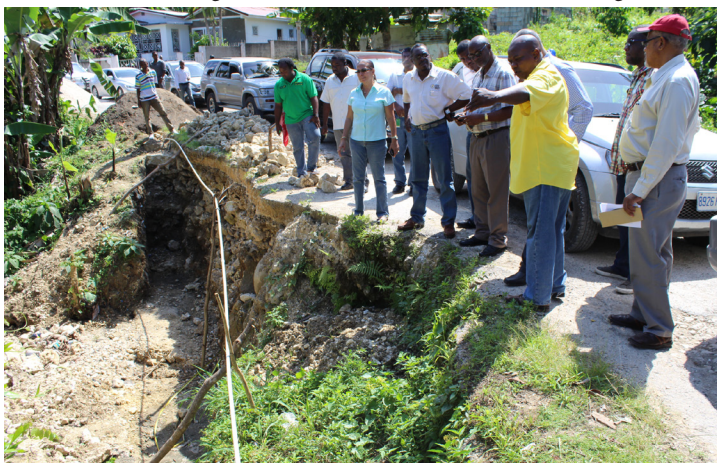
Mayor of St. Ann's Bay Desmond Gilmore, points to work being done in a section of St. Ann's Bay. Minister Azan (partially hidden). State Minister for Local Government, Colin Fagan and Member of Parliament for North East, St. Ann, Shahine Robinson (3rd right), were also present.