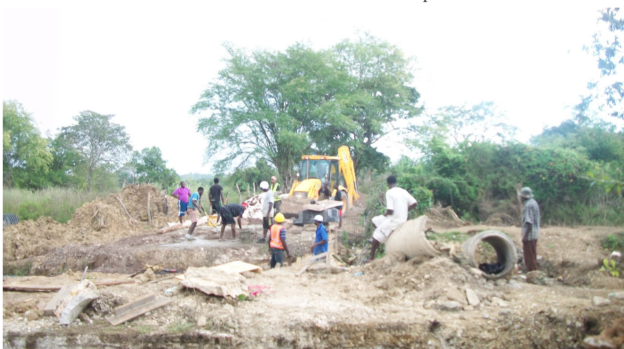
Excavation to remove and install Culvert Pipes in New River