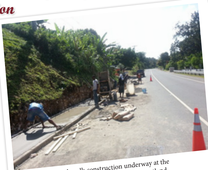
Sidewalk construction underway at the St. Margaret's Bay Square in Portland

A lot of the changes are due to infrastructural development, such as roads and bridges being constructed, repaired or maintained. In fact, in recent years the parish has seen major infrastructural projects, such as the construction of the Rio Grande and Craigmill Bridges; the renovation of the Fellowship to Berrydale main road; the construction of retaining walls in the Rio Grande and Buff Bay Valleys; interspersed with routine hotmix and spray patching, as well as other forms of maintenance throughout the parish.