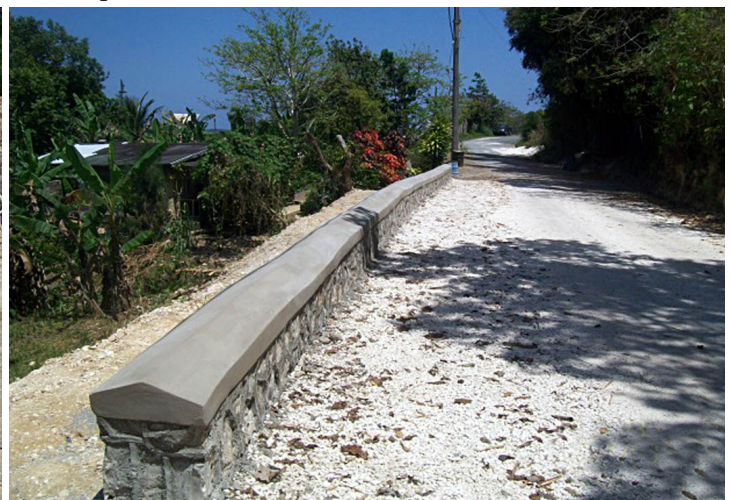
Random Rubble Retaining Wall along the Free Hill roadway during and after construction