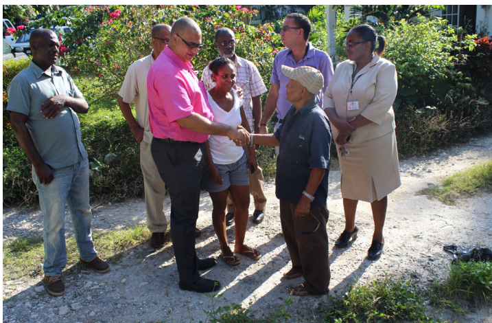
Minister Azan greets a resident of Western Portland.