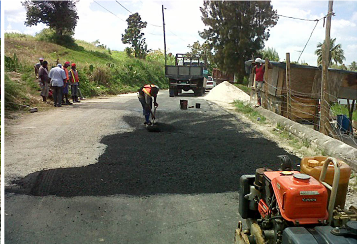
Sheet patching underway along the Free Hill main road in St. Ann