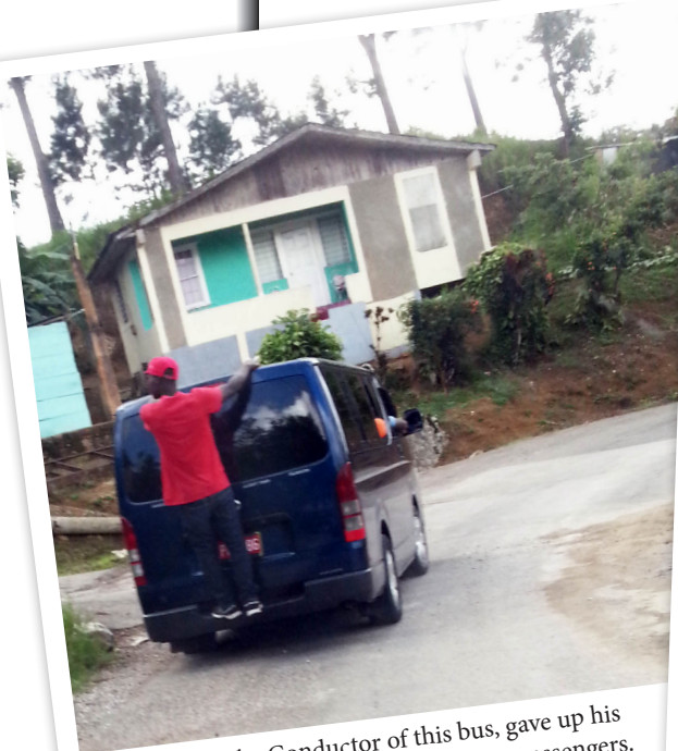
Seriously! The Conductor of this bus, gave up his 'space' on this bus to accommodate more passengers. But guess where he had to ride?