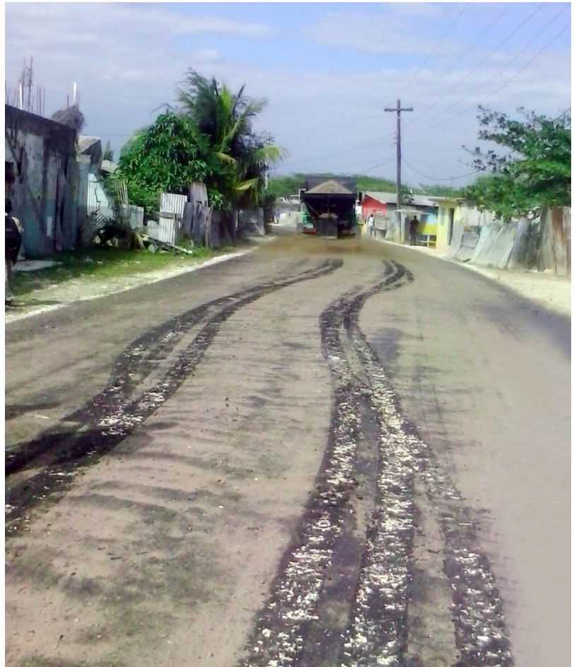
Road being sanded after oiling as part of the construction process.