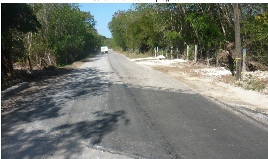
The section of the Font Hill main road after the completion of the works