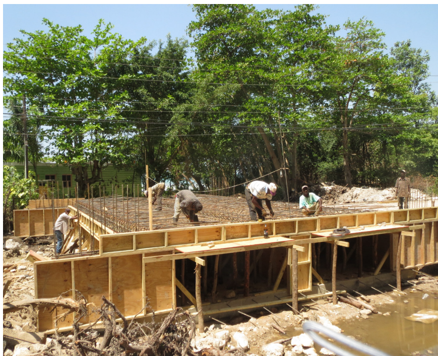
Workmen preparing the deck of the Cave Bridge for the pouring of concrete

It is generally accepted that a good road network drives development. In this vein, the Government of Jamaica is investing even further in the road infrastructure in the area, through a $300 million dollar project to rehabilitate the corridor between Belmont and Scott's Cove and the construction of a new bridge in Cave, Westmoreland. These project follow closely on the heels of a $497 million project which saw the complete rehabilitation of the roadway between Ferris Cross and Belmont.